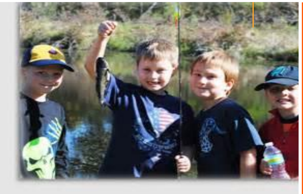
Fishing Derby/ Fun Day is September 14th, at "The Lagoons" North of Frankfort