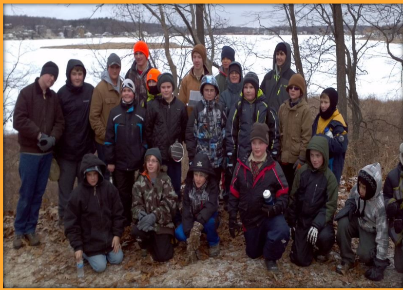
Scouts at Pokagon State Park