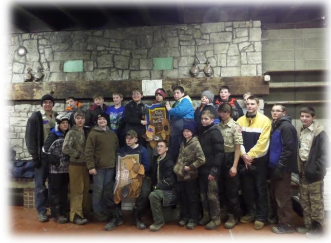
Pack & Troop 359