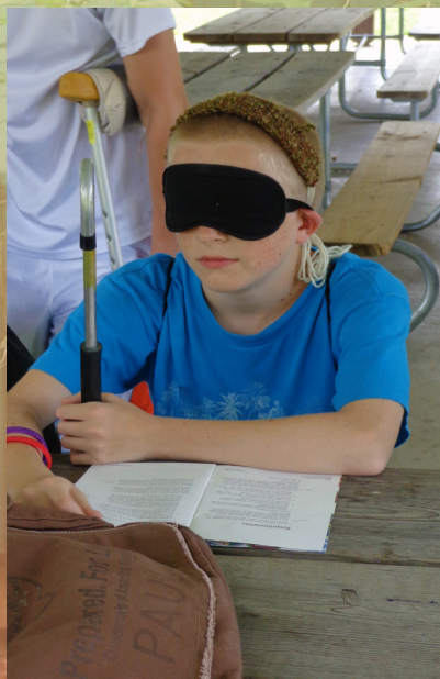
Disability Awareness merit badge