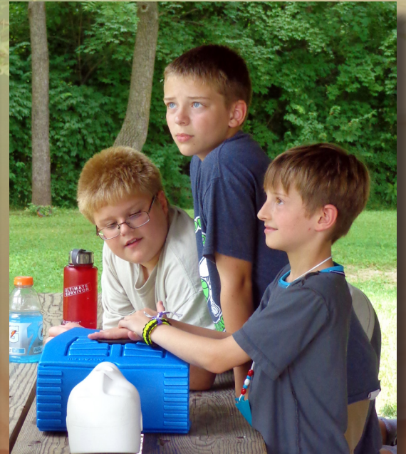
First Aid merit badge